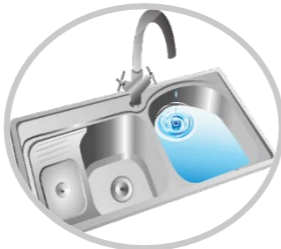
Kitchen Sinks & Faucets