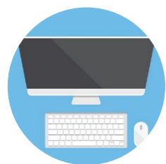
Computers Keyboards Mouse