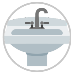
Bathroom Sinks & Faucets