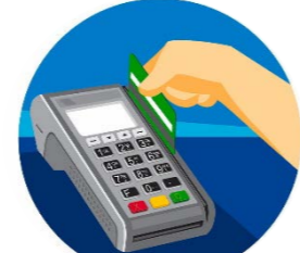
Payment Pads Stylus